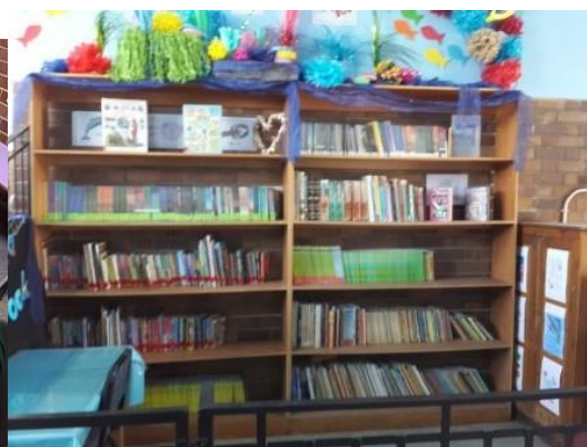
Books in Silverlea