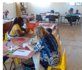
reading with children