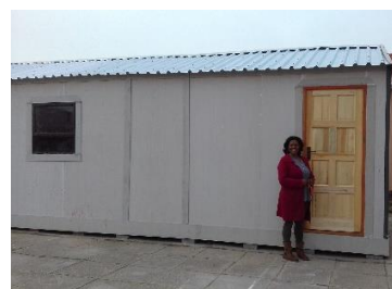
the new empty library