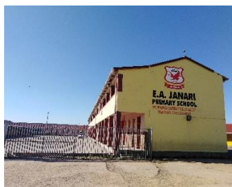
E A Janari school

This reading ministry has opened up doors to a prayer walk in the community, and we hope to find ways to build bridges between our communities. We pray that God's love will be revealed to these children as the volunteers are empowered by the Holy Spirit to represent Jesus in the school. There is no library at the school yet, although a wendy house has been donated last month by an NGO. We are praying that various secondhand books can be donated to fill this library for the school. We are looking into partnership and funding for the library from a few different sources.