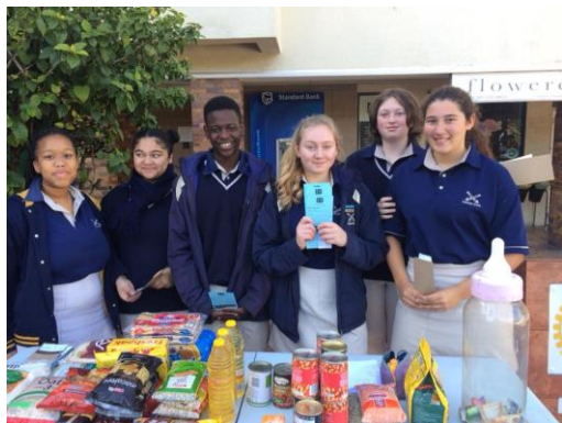
Cannons Creek Independent School

Our volunteers for the year of 2018 came from four schools. A big thanks to Cannons Creek Independent School, Pinehurst Primary, Pinelands High School and Rustenburg High School for Girls. In total, food to the value of R19 078.72 was raised through our volunteers serving at our Saturday food drives.