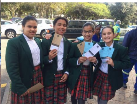
Pinehurst Primary School