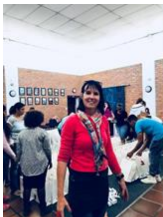
Christmas Party 2018 Preparation

happen both in the Schools and during Holiday Club.