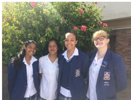
Pinelands High School