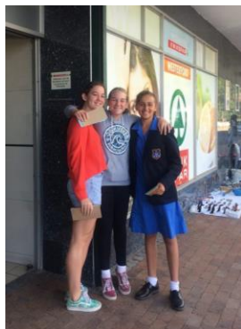
Rustenburg High School for Girls