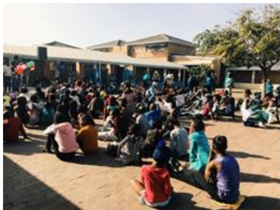
Holiday Club 05 – 06 April 2018