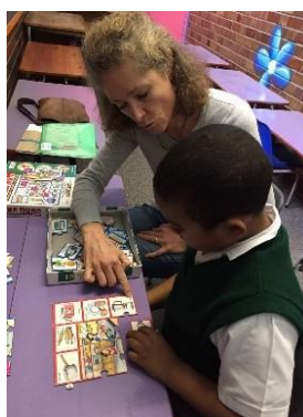
Reading with children at Silverlea